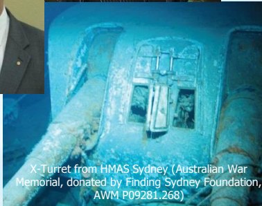
X-Turret from HMAS Sydney

REGISTRATION FEES: Fully paid up SUT Members (Perth Branch) attend FREE, providing registration is made by Thursday 31 October. After this date a charge of $20 will apply.