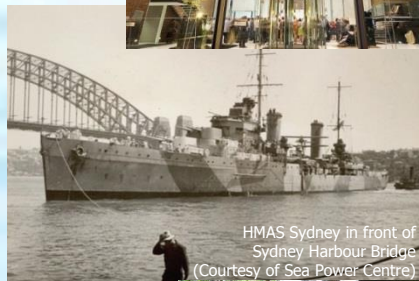
HMAS Sydney in front of Sydney Harbour Bridge