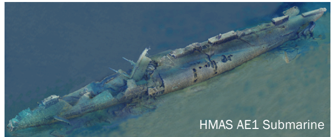
HMAS AE1 Submarine

The 54-metre-long Australian submarine, HMAS AE1, the most technologically advanced in the world at the time, vanished off Papua New Guinea during the First World War. Many attempts at finding the AE1 have been futile. In December 2017, a new search, the thirteenth, was conducted by Fugro using its vessel Fugro Equator and her autonomous underwater vehicle (AUV) Echo Surveyor V.